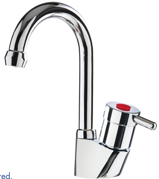
35Φ Mounting Hole